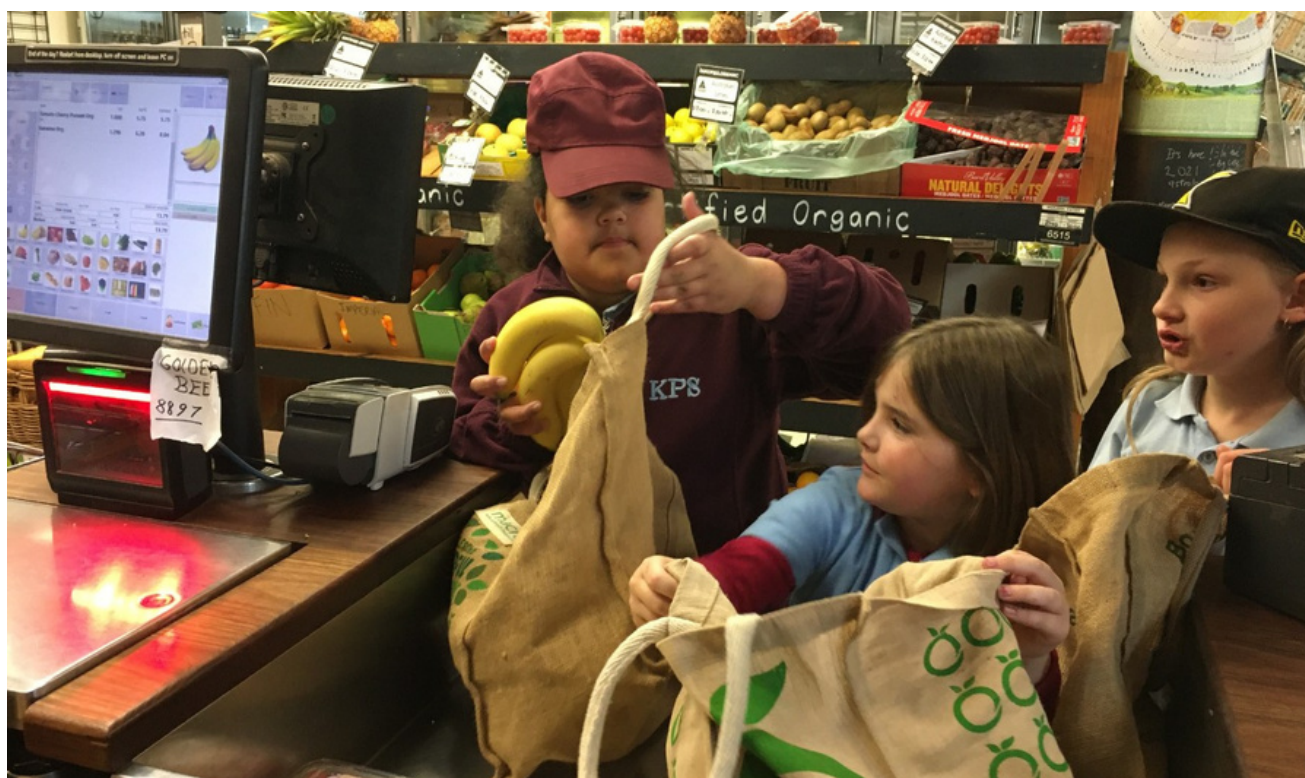
Students from Katoomba Public School purchase Crunch & Sip supplies with their Co-op donation

Blue Mountains Food Co-op, Donations Coordinator